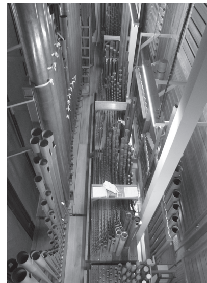
View of Great, Positiv and Pedal ranks

5) There were two complete changes. The Great mixture, Fourniture III–V, was of extremely large scale in the trebles and at full volume would have been