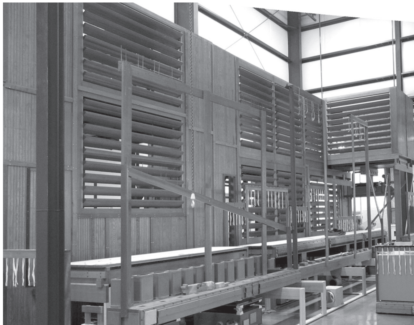
Organ framing set up in the Schoenstein & Co. erecting room

The music library at the University of Texas verifies that 130 individual organists had performed 293 programs on Opus 1024 over the years 1942–1981. Among the famous organists presented were Catharine Crozier, Alexander Schreiner, Arthur Poister, David Craighead, Marcel Dupré, Carl Weinrich, Virgil Fox, Flor Peeters, Claire Coci,