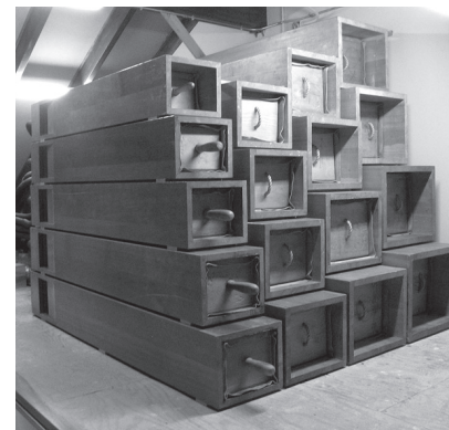
The 32' Contra Bourdon installed on shelf above organ

too loud for its new home. Therefore 285 new pipes were made and the original pipes were carefully wrapped and boxed and are in the storage area of the new sanctuary. The same was true of the treble pipes of the Great Quint, which were replaced.